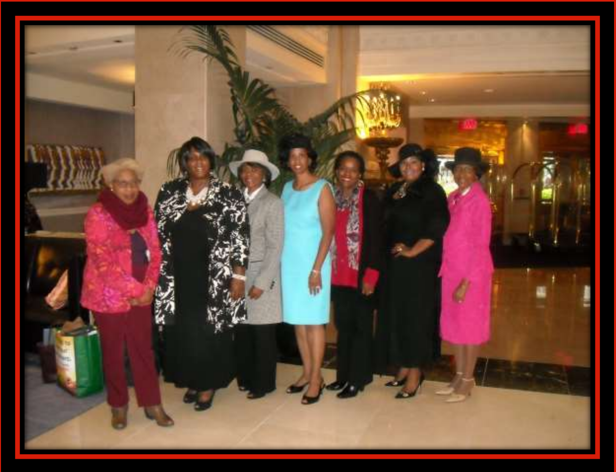
Edgar Restaurant in the Historic Mayflower Hotel Washington, DC (October 4, 2015)